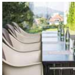
Meeting room C