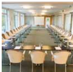
Meeting room A+B