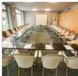
Meeting room A