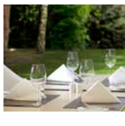
Orangerie with adjacent garden