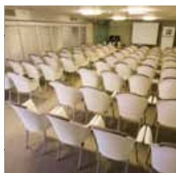
Meeting room D